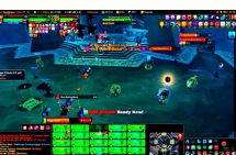
How to get healbot on wow. Wow classic healbot guide. Wow healbot setup. Wow how to use healbot. Wow healbot guide deutsch.